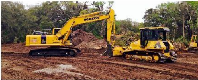
A construction project involving soil disturbance

Before commencing construction activities, the owner or operator of a construction project that involve soil disturbance of one or more acres must obtain permit coverage under the State Pollutant Discharge Elimination System (SPDES) General Permit for Stormwater Discharge from Construction Activity.