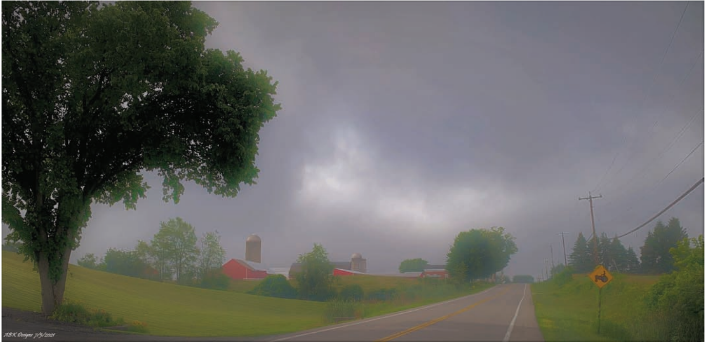
Harris Road Morning, Photo submitted by Alan B. Kardon